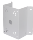
SN-BK340A Corner Mount