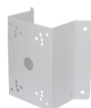
SN-BK340A Corner Mount